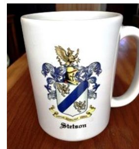
16 oz.STETSON MUG!!