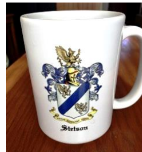
16 oz.STETSON MUG!!